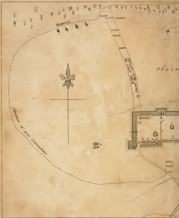
A Plan of Fort Sandusky, at Lower Sandusky. —Line 1, Pickets. Line 2, Dry ditch nine feet wide by six feet deep. Line 3, Inward embankment, or which the ditch was raked by our artillery. Line 4, Outward embankment, or which the ditch was raked by our artillery. C. Guard block house. D. Store house. G. Magazine. H. Fort gate. K. Wicker gates. L. Partition wall. P. Well. Z. Partition wall. Length of the fort, ninety-five yards. Breadth of do. forty-eight yards.