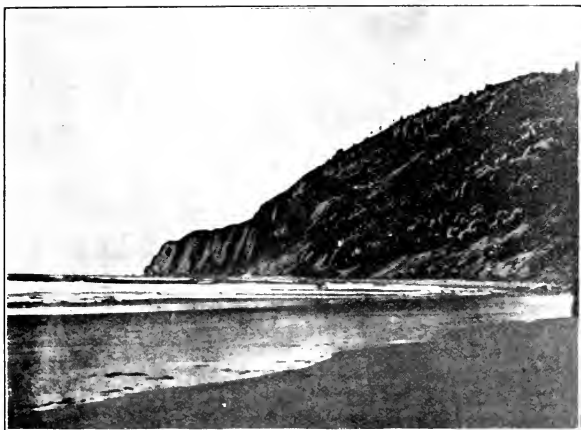
Upper end of Nehalem spit, where beeswax was found.