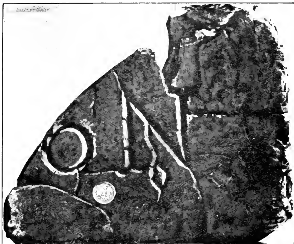
Large cake of Nehalem wax, showing engraved character. This cake, when whole, measured about 20 x 6 x 16 inches. Portland City Museum.