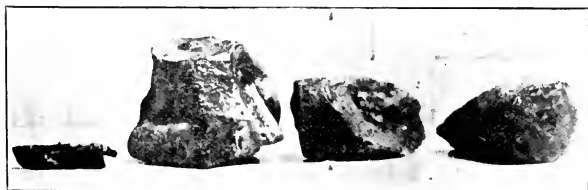
Fragments of candles. Portland City Museum.