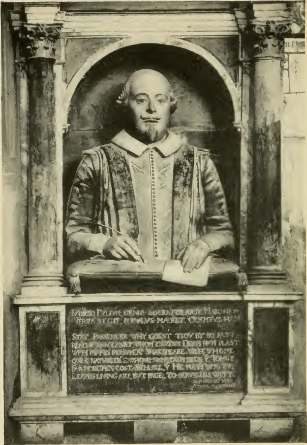
BUST OF SHAKESPEARE IN TRINITY CHURCH, STRATFORD His grave is directly beneath the bust.