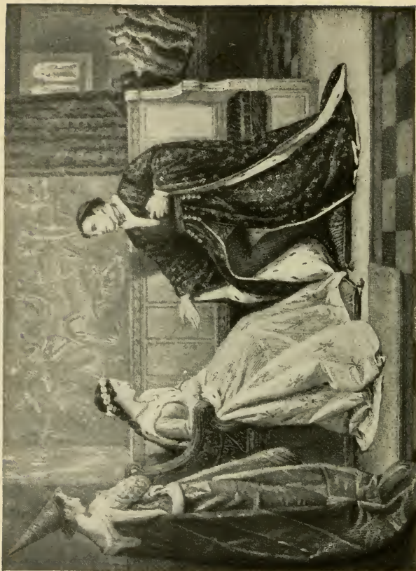
King Henry. I KNOW NO WAYS TO MINCE IT IN LOVE, BUT DIRECTLY TO SAY, 'I LOVE YOU.'